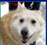
Casper - BLONDIE in rescue