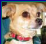
Casper - ROSIE in rescue