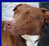
Casper - CINNAMON in rescue