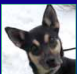
Casper - RAMSEY in rescue