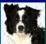
Sheridan - BLAZE adopted